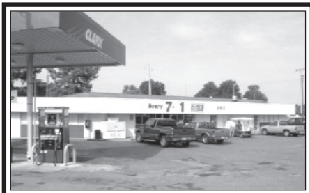
#40018- CONVENIENCE STORE- Located off of Hwy 82 in Avery, TX. Fully furnished w/ approx. 4,800 sq ft under roof, and approx. 448 sq ft of storage in back. Walk in and take over business opportunity. $650,000 Call Shane Harvey for much more information.