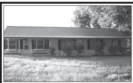
#25176- RANCH STYLE/ RESIDENTIAL- 3BR, 3 BA brick home on 2+/- acs., metal roof, lrg. rooms, sunroom, back deck/patio, ceiling fans, carport, 2 storage bldgs. 2 BR, 1 BA fix up mobile home included. $75,000 Call Choice Smith