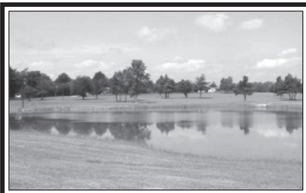
#40054- MULLIGAN GAME RANCH- 500+ Acs. of beautiful hunting land & recreation w/ all the amenities. 4 BR, 3 BA manufactured home, completely furnished. 2 Liv. areas, lrg. kit. w/ bar. Cabana, relaxing spa, shop, guest home, atv trails, stocked lake & ponds, abundant wildlife. Call Shane Harvey