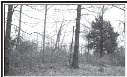
#25177- HOMESITE/ RECREATIONAL- 20+ Acs. of land great for a building site. Wooded w/ approx. 5+ acs. cleared, secluded. $58,600 Call Choice Smith

Choice Smith, Sales Associate 903-277-3745