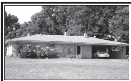
#15232- RANCHETTE W/ BRICK HOME- 23+ Acs. of flat terrain land, all open w/ perimeter fencing, apple & plum trees, pole barn, storage. 3 BR, 1.5 BA brick hm loc. in Avery ISD. 2 BR, 2 BA mobile home also included w/ this property. $149,500 Call Tina Kruse