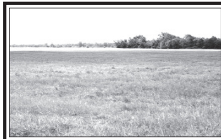
#15236- RANCLAND- 140+ Acs. of land great for ranching, farming, all open w/ rur. water, 30+ ac. hay meadow, 3 pastures, scattered trees. Owner will finance! $2,000 per acre. Call Tina Kruse