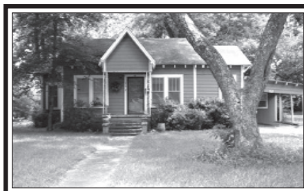
#25172- HISTORICAL HOME- 3 BR, 1 BA frame home on double lot. Lrg. trees, quiet setting w/ lovely homes surrounding, built in appliances. Very nice! $49,500 Call Choice Smith

15230- RESIDENTIAL ON 3+ ACRES! - 3 BR, 2 BA frame home on 3+ acs., flat terrain, fencing, all open w/ fruit & nut trees. Home has elec. h/a, front porch, well. Secluded setting! $79,500 Call Tina Kruse