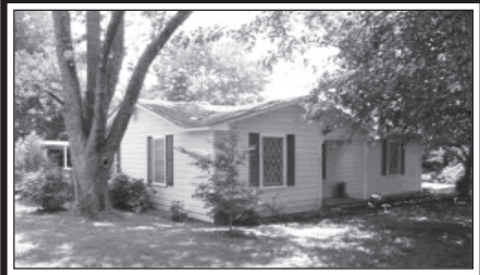
COUNTRY COTTAGE ON SMALL ACREAGE! 3/1/2CP, recently updated, storage building, building in back has CH/A & could be guest house or rental income. Great patio, partially fenced and on 7+/- acres! MLS#10001750 $94,900