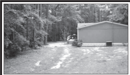
NESTLED AMONG TALL PINES! This 3/2 is on approximately 1 acre with open deck on front to enjoy the view and large open living area for entertaining! Don't wait to see this one! MLS#10000959 $59,900