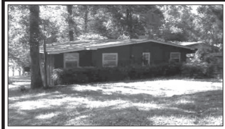
WATERFRONT LAKE WINNSBORO! 2/1 frame home with new windows, hardwood floors, WBFP, concrete patio, overlooking big water of beautiful Lake Winnsboro! MLS#1000072 $123,500