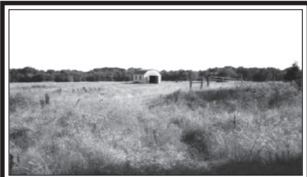
COUNTRY LIVING AT ITS BEST! 23 fenced Acres mostly pasture and some woods with 2 ponds, storage building, barn and clear water septic system! Approximately 12 miles from Sulphur Springs! MLS#10000995 $78,500