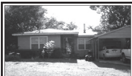
COME TAKE A LOOK TODAY! 3/1/1 Frame, large living with open floor plan, fenced back yard in established neighborhood conveniently located in Sulphur Springs! MLS#10000996 $64,900