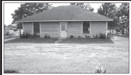
GREAT INVESTMENT OR FIRST HOME! This 2/1 frame home sets on 3/4 acre just minutes from fishing in famous Lake Fork with nice sized living room, open kitchen/dining and needs some TLC! MLS#10002015 $39,900