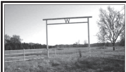
SECLUDED ON A COUNTY ROAD! 75+/- fenced and cross-fenced acres with 4 pastures surround by trees, 2 ponds, white pipe fence across front and a home site for your dream home. Cypress Creek on back of property. MLS#9994376 $240,000