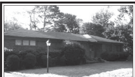
HILLTOP SETTING! This nice 3/2/2 brick home with 2 living areas has a large tree-shaded back yard, custom features and hardwood floors under carpet waiting to be renewed needs updating but could be a super home! MLS#10000597 $94,900