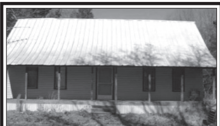
LITTLE HOUSE ON THE PRAIRIE! A diamond in the rough, 2/1.5/1 frame home w/siding and a metal roof in a great location, close to town but in the country w/a great front porch & stor bldg on 3.6+/- acres! MLS#9997236 REDUCED - $50,000