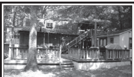
COZY PLACE TO CALL HOME! 3/2/1CP 2 story frame on 4 lots with RV hookups, wood burning stove, 2 living areas, Fire-place in Master Bedroom, Living area upstairs has wet bar! MLS#10000854 $64,900