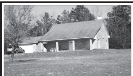
YOU NEED TO SEE THIS ONE! 2/2/2 brick built approx. 1997 with one bedroom and bath upstairs and one bedroom and bath downstairs, WBFP, partial fence on 2 acres. MLS#9997279 $99,500